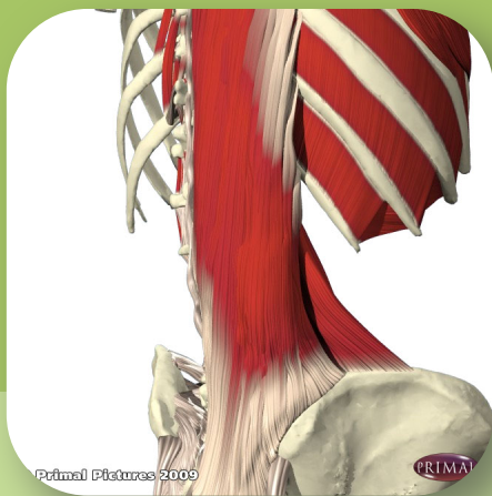
Fig. 5 Erector spinae overlies and hides multifidus