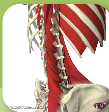
Fig. 6 Multifidus muscle fibers cross L5-S1