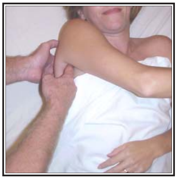
Fig. 3: Scapular positioning enhances access to subscapularis

Once in place, gentle, static pressure is applied by the finger pads of the practitioner's right hand'at 1" intervals onto all accessible fibers of the <u>subscapularis</u> muscle. Friction of this muscle is not usually tolerable until the subscapularis is in a healthier state.